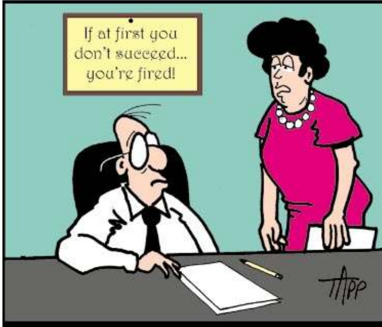
"The Praise Team wants a bigger budget, or they're going to take their show on the road"