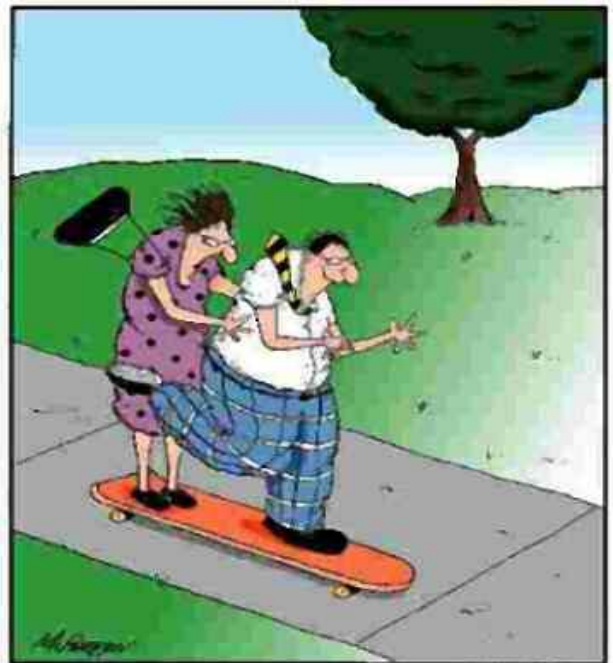
"When you said your wheels were parked outside I sort of thought you meant a car."