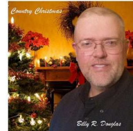
COUNTRY CHRISTMAS (2016)