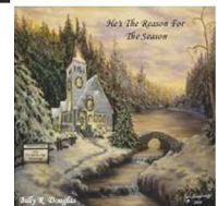
He's The Reason For The Season (2009)