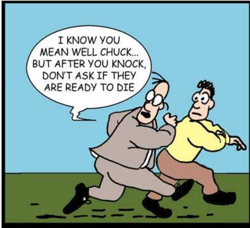
One good sign you need more training in the area of visitation...